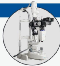
DIGITAL SLIT LAMP SL650+