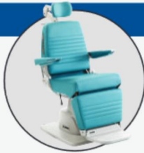
CHAIR RELIANCE 6200