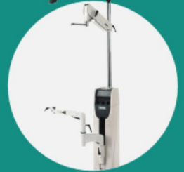
■ STAND Reliance 7900