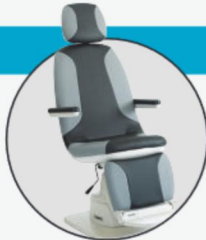
CHAIR RELIANCE 520