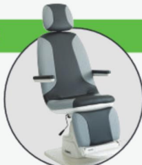
CHAIR RELIANCE 520