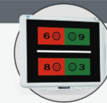
CHART SYSTEM CS 550