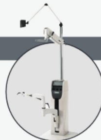
STAND RELIANCE 7900