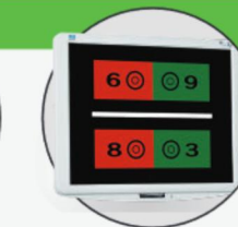
CHART SYSTEM CS 550