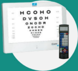
■ CHART SYSTEM CS POLA 600