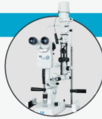
DIGITAL SLIT LAMP SL550L