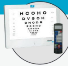
CHART SYSTEM CS POLA 600