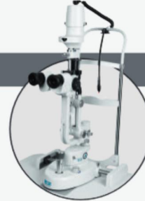
SLIT LAMP SL350LE