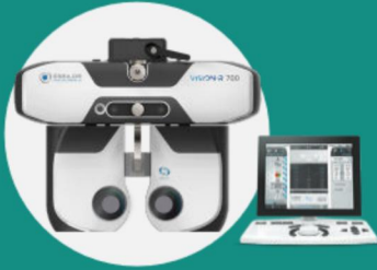
■ VISION-R™ 700 Refraction System