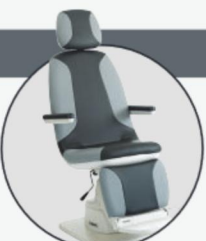
CHAIR RELIANCE 520