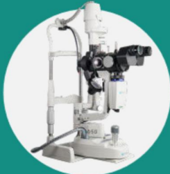
■ DIGITAL SLIT LAMP SL650+