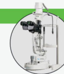
SLIT LAMP SL450LE