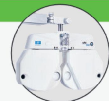
AUTOMATIC PHOROPTER APH 550