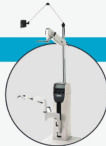
STAND RELIANCE 7900