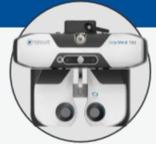
REFRACTION SYSTEM VISION-R™ 700