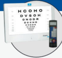
CHART SYSTEM CS POLA 600