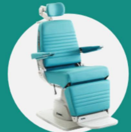
■ CHAIR Reliance 6200

Essilor Instruments is a global leader in the development of state-of-the-art optometric and ophthalmic equipment. Our goal is to provide practices the equipment and services that will meet their business needs and help them build relationships with patients.