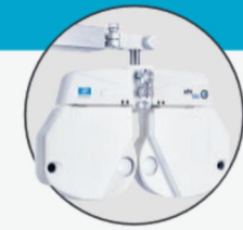
AUTOMATIC PHOROPTER APH 550