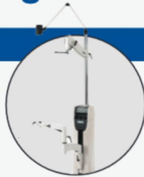
STAND RELIANCE 7900